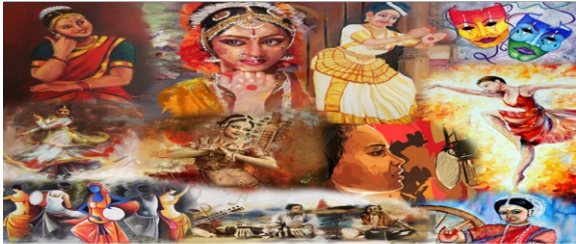
Global Council of Art & Culture

Akhil Bharatiya Sanskrutik Sangh is an Cultural Regd. NGO engaged in a variety of Glo Integrity development programs covering various Cultural & Social events. ABSS is building up bridges for the youth through cultural & educational events by giving opportunity to learn and develop by acquiring knowledge about the performing arts, conservation & promotion.